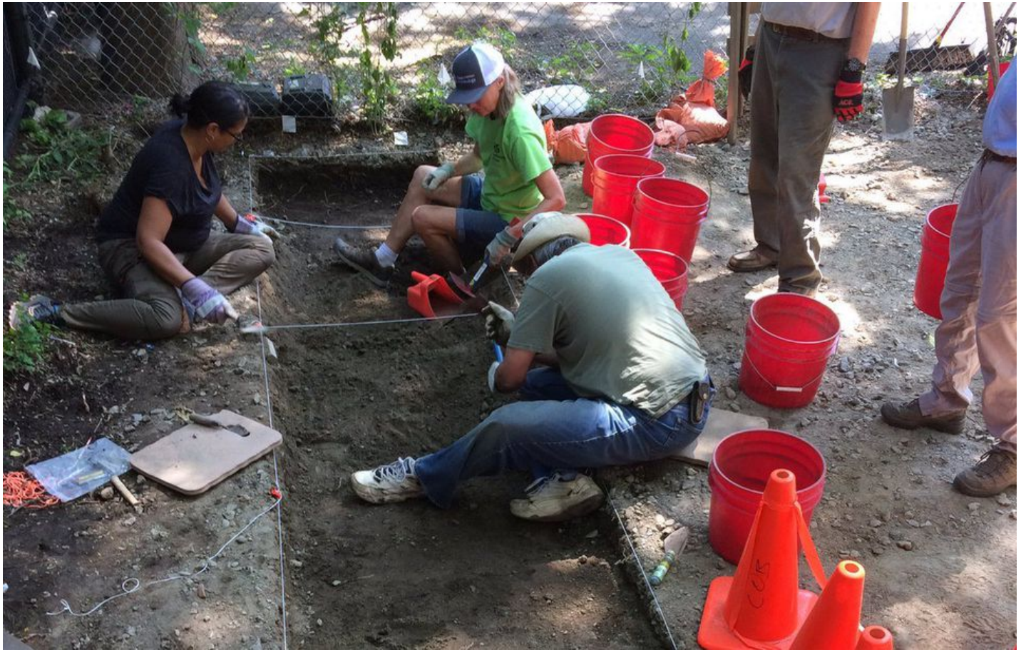
An archeological dig is underway at 6 Hudson St. in Chinatown.